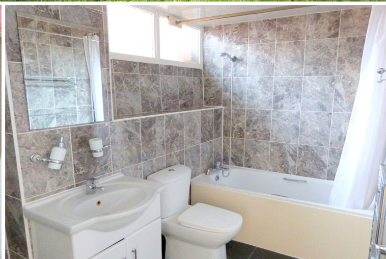
Dovedale Close HAREFIELD, MIDDLESEX, UB9 6DQ